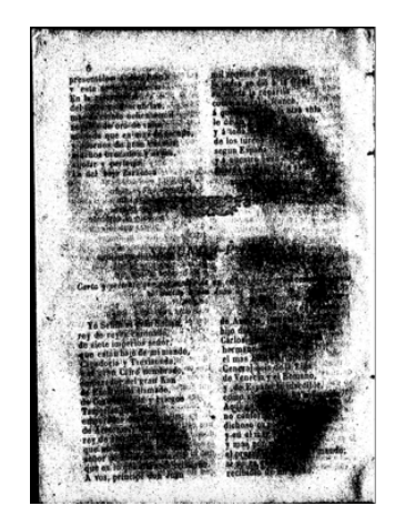
Figure 5: Example of unusable pre-processing (combination of techniques: Sharpening and Thresholding binarization)

A second series of tests was performed by combining binarization with another image enhancement method. We did not launch any automatic transcription model training if the image obtained was clearly unusable for the tool; this is the case, for example, when combining a deblurring method (sharpening kernel) with the Thresholding binarization (Figure 5).