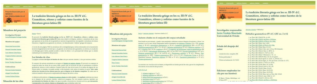
Figure 1. The Project web site.